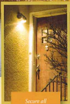
Secure all points of entry and keep them well-lit.