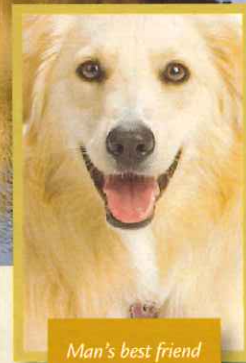
Man's best friend is still an intruder's worst nightmare.