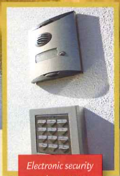
Electronic security systems are a great investment and add to your home's value.